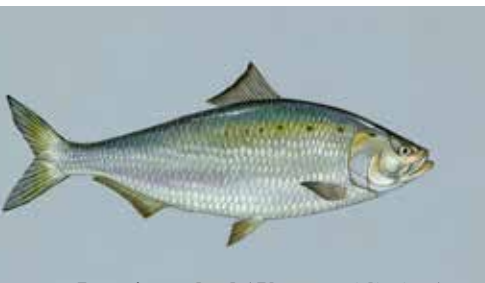
American shad ( Alosa sapidissima )

How can an ocean fish and an obscure shrub be intertwined and even carry the same name? That's one of the mysteries surrounding American shad (Alosa sapidissima) and shadbush (Amelanchier arborea). Both are native to New