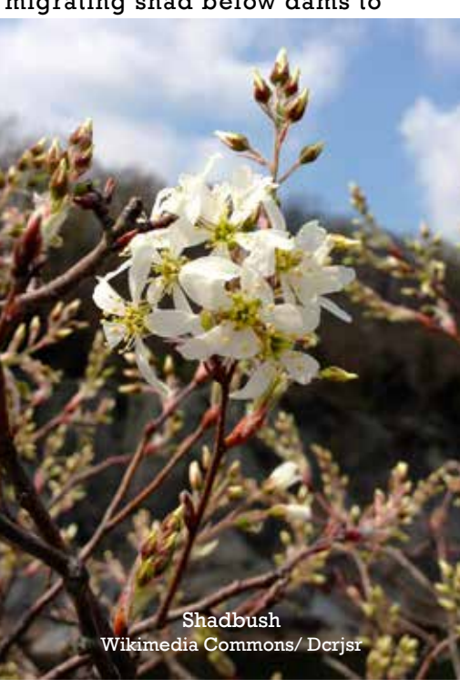
continued on page 11

Coinciding with the spring shad run is the blooming of an early shrub or small tree, named